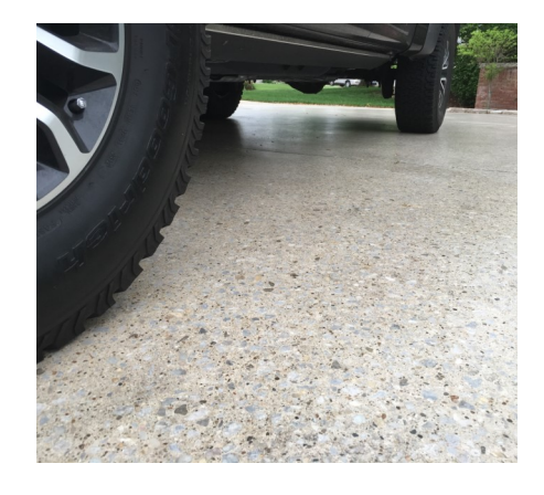
Large Aggregate Grind & Polish for Outdoor patio, driveway, porch, etc..

Concrete is strengthened by removing the cream and exposing the large aggregate surface with a diamond polish to leave a one-of -a-kind beautiful low maintenance surface that will last a lifetime.