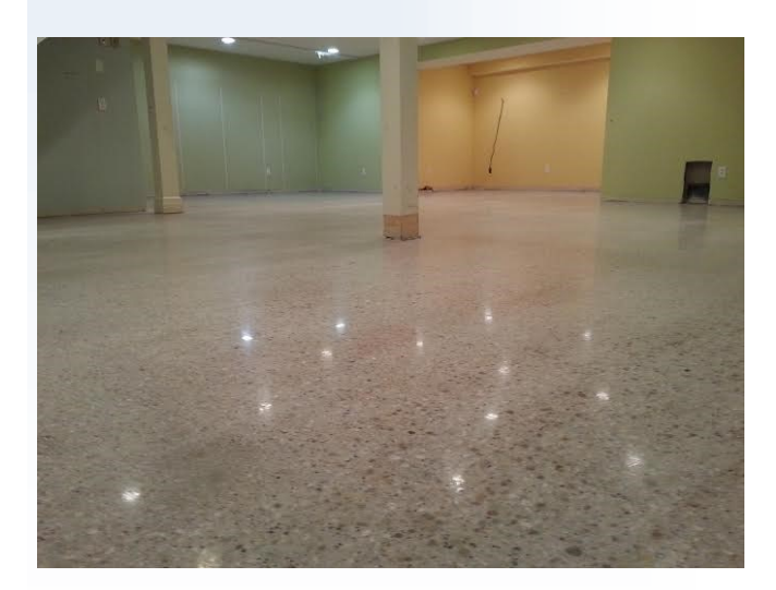
Grind & Polish for indoor

Concrete Ink can demo your existing flooring to expose concrete surface followed by a process of profiling, hardening, and polishing. We finish up with a sealer/guard (stain can be added) to leave a beautiful, easy to maintain floor that will last a lifetime.